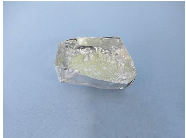
5#- Test Sample