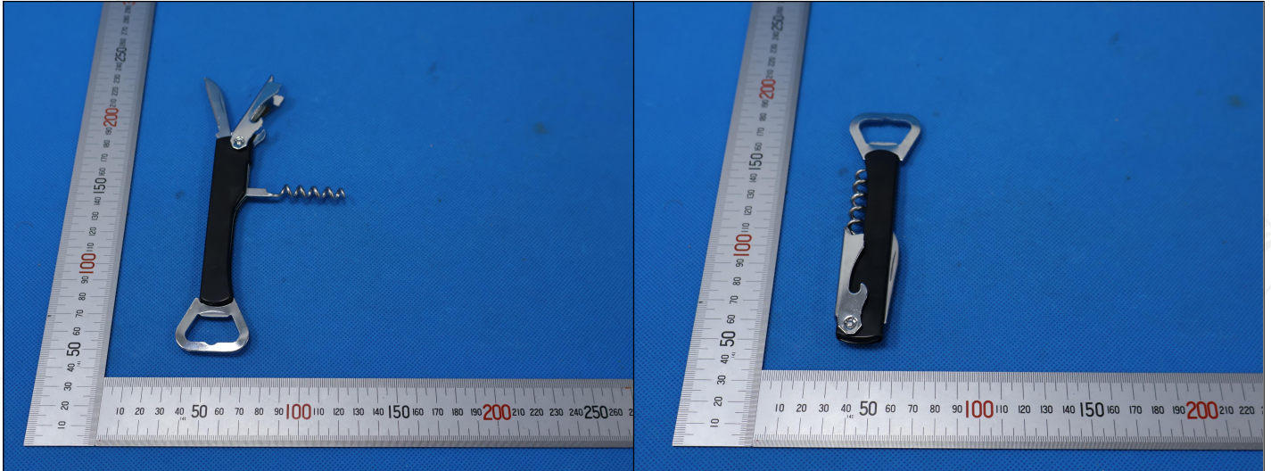
Test Sample Photo